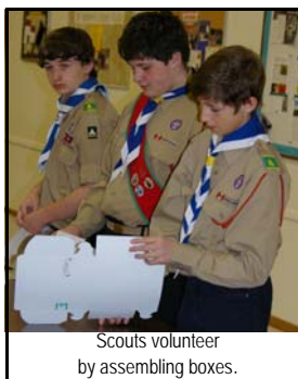
Scouts volunteer by assembling boxes.

volunteering for our agency, give us a call at (519) 337-3701.