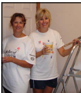
Volunteers work at painting a room at Kendall Street.

Our annual Volunteer Appreciation BBQ was held on September 16 at our Kendall Street location, where we were able to say a big THANK YOU for their assistance. We are always thankful for our volunteers....if you are interested in