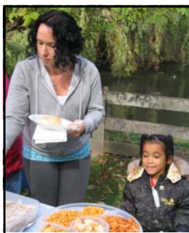
Thanksgiving at Canatara Park